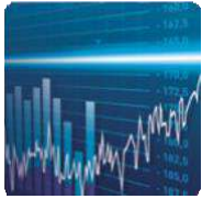
TEST &amp; MEASUREMENT

For more than 70 years, the SPINNER Group has been setting new standards worldwide in high-frequency technology. Based in Munich with production facilities in Germany, Hungary and China, SPINNER currently has over 1,000 employees. Our international network of subsidiaries and distributors supports customers in over 40 countries.