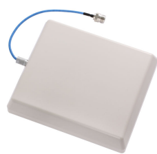
Cell-Max™ Directional In-building Antenna, 698–960 MHz, 1710–2700 MHz

This product will be discontinued on: July 30, 2022