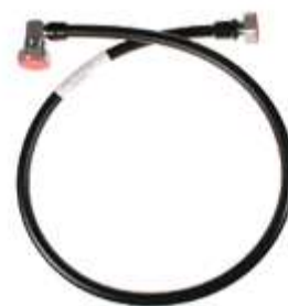
7M7MRL38-0100FFP for EXAMPLE