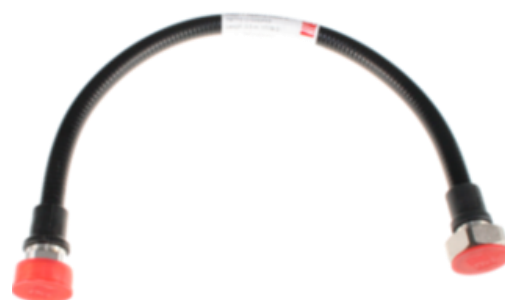
7M7MS12-0100FFP for EXAMPLE